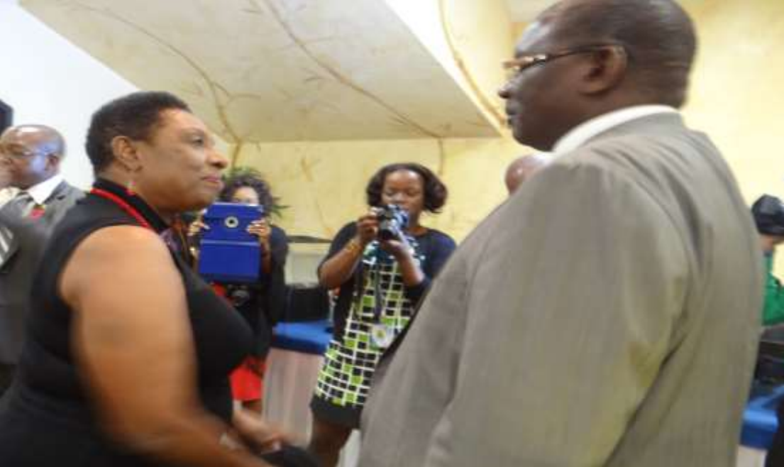
Four local entities (UNESCO Clubs, JCDC, UWI, JNC-UNESCO-MAB) received their grants funded through the UNESCO Participation

Programme. The grants are to carry out projects in the areas of music, gender, youth development and science. The cheques were presented by Hon. Minister Grange.