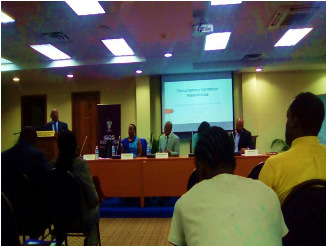
IGDS Dissemination workshop on Contemporary Masculinities

29-30 June 2017: UNESCO's Caribbean Humanities Symposium was held at the UWI, Mona, with a focus on providing a platform for youth to share their views on matters pertaining to humanities.