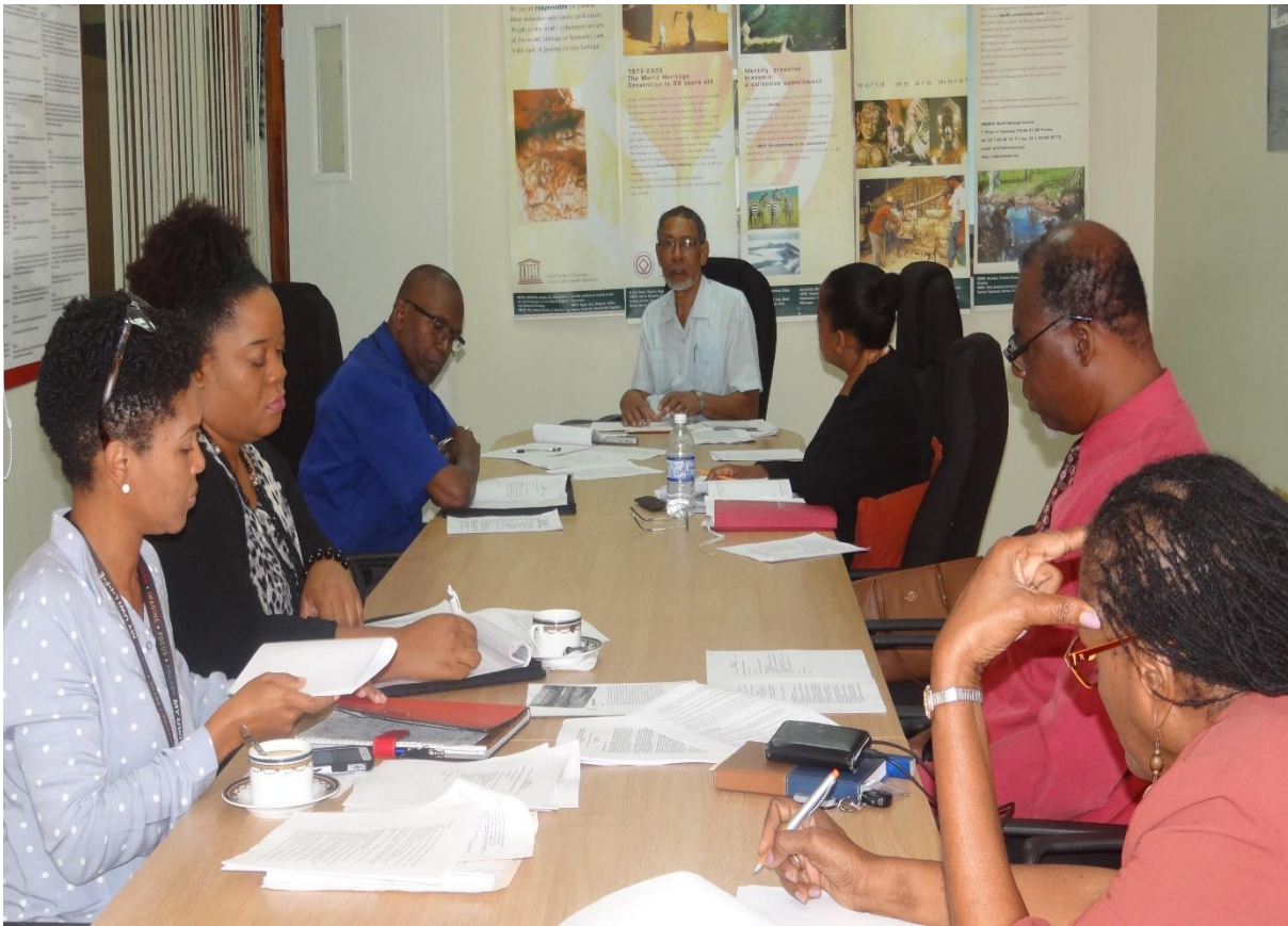
A Science Advisory meeting in session