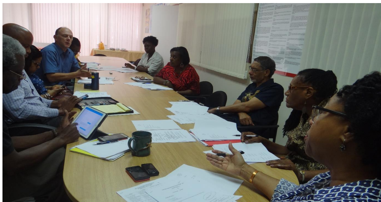
MAB Committee meeting in session