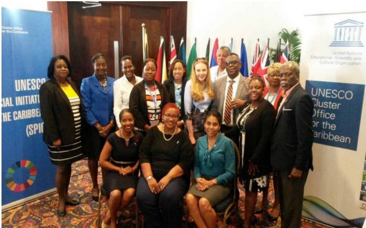
Director, UNESCO Caribbean Office and SG’s during the Consultative meeting

Among agenda topics were Key outcomes and best practices of the national commissions for UNESCO in 2016-2017; Key outcomes of the cluster office in 2016 – 2017; Education 2030 Agenda; Executive Board Debriefing; UNESCO’s approach to the 2030 Agenda for Sustainable Development. Overview and Processes; as well as Panel discussion on the Special Initiative for the Caribbean, (SPIC).