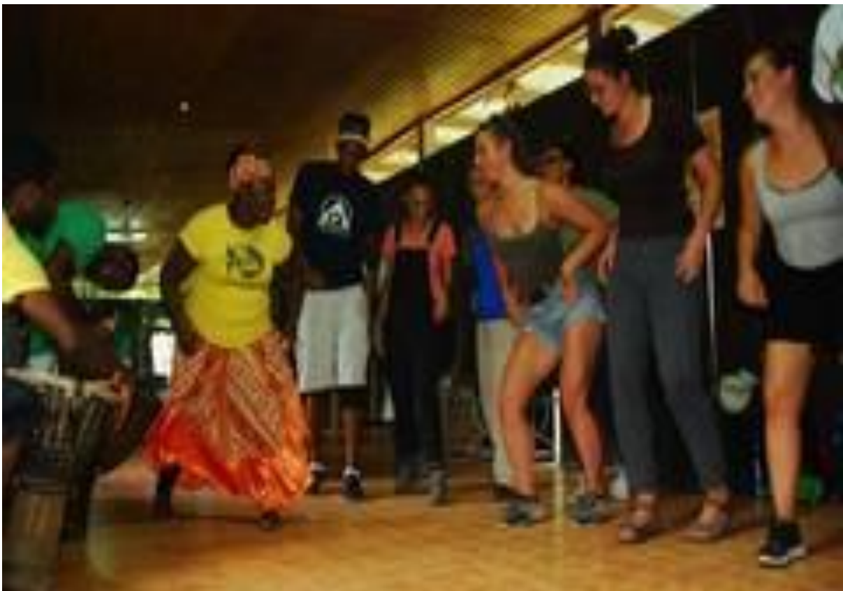
Action Campers learning the local dance

22 September 2017: Eight volunteers from the United Kingdom, Belgium, Guyana and Jamaica completed a 10-day orientation of Jamaica's UNESCO World Heritage Site – the Blue and John Crow Mountains National Park. The camp was the first of its kind in the Caribbean and was led by the Jamaica Conservation and Development Trust (JCdT); manager of the National Park. The World Heritage Youth Action Camp is part of UNESCO's World Heritage Education Programme which aims to increase awareness, knowledge and skills among young adults about world heritage management. The initiative which began in 2008 encourages youth to play an active role in preserving and promoting World Heritage Sites.