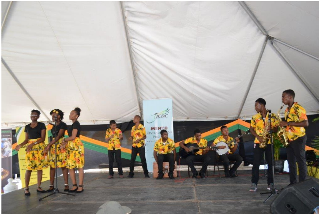
One of the new mento bands in action

November 2017: The UNESCO Participation Programme project "Revitalisation of Mento" was executed and completed by the Jamaica Cultural Development Commission (JCDC) for the preservation and promulgation of the roots culture Mento Music by developing 5 new youth bands and a training DVD. The leaders of the 5 bands (Red & Gold, Steady Rockaz, Melody Vybez, Minty and Rhumbakah) have signed contracts to keep the bands functional and to submit a report once per year for 5 years. The JCDC is to reintroduce a Mento Band Competition in its annual National Festival of Arts competition.