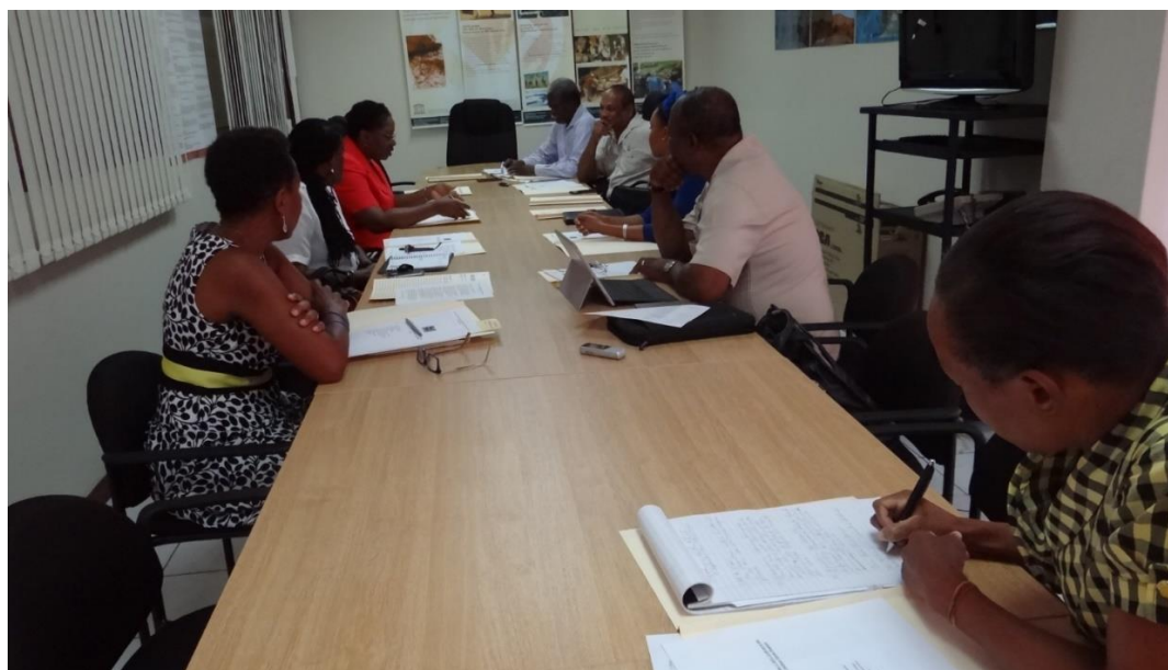
Members of the NBCJ in meeting