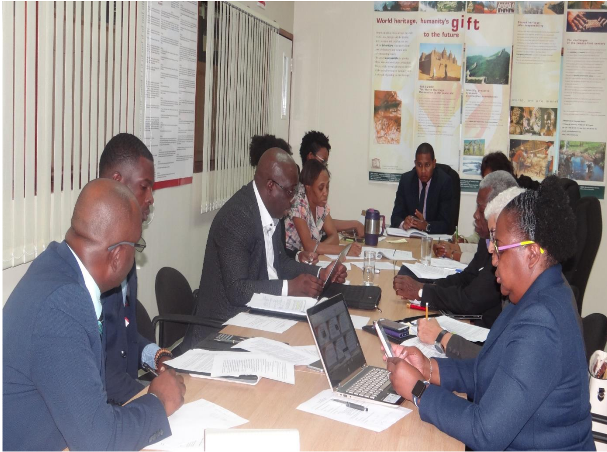
Minister Floyd Green chairing the Education Advisory meeting