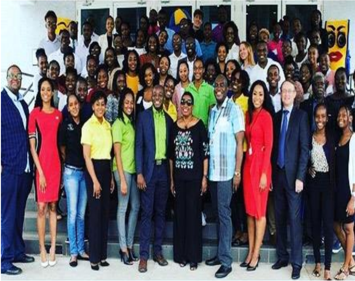
Hon Minister flanked by participants of the Youth Forum (UNESCO Youth Engagement Project)

15 June 2017: Odayne Haughton, a member of JNC-UNESCO Youth Committee, represented at the PBCJ Youth Consultation. It was the first of two Youth and Public Media Access consultations hosted by the Public Broadcasting Corporation of Jamaica (PBCJ) at the Jamaica Conference Centre. Organised in collaboration with the Ministry of Education, Youth and Information; the Broadcasting Commission and the Social Development Commission, the forum was aimed at consulting with young persons to create content relevant to the needs of today's youth. State Minister for Education, Youth and Information, Hon. Floyd Green (Chair, JNC-UNESCO Education Advisory Committee), who spoke at the opening ceremony, said the activity