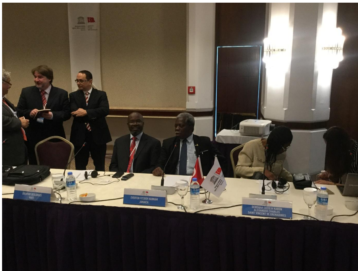
Delegates at break during meeting of NATCOM in Turkey