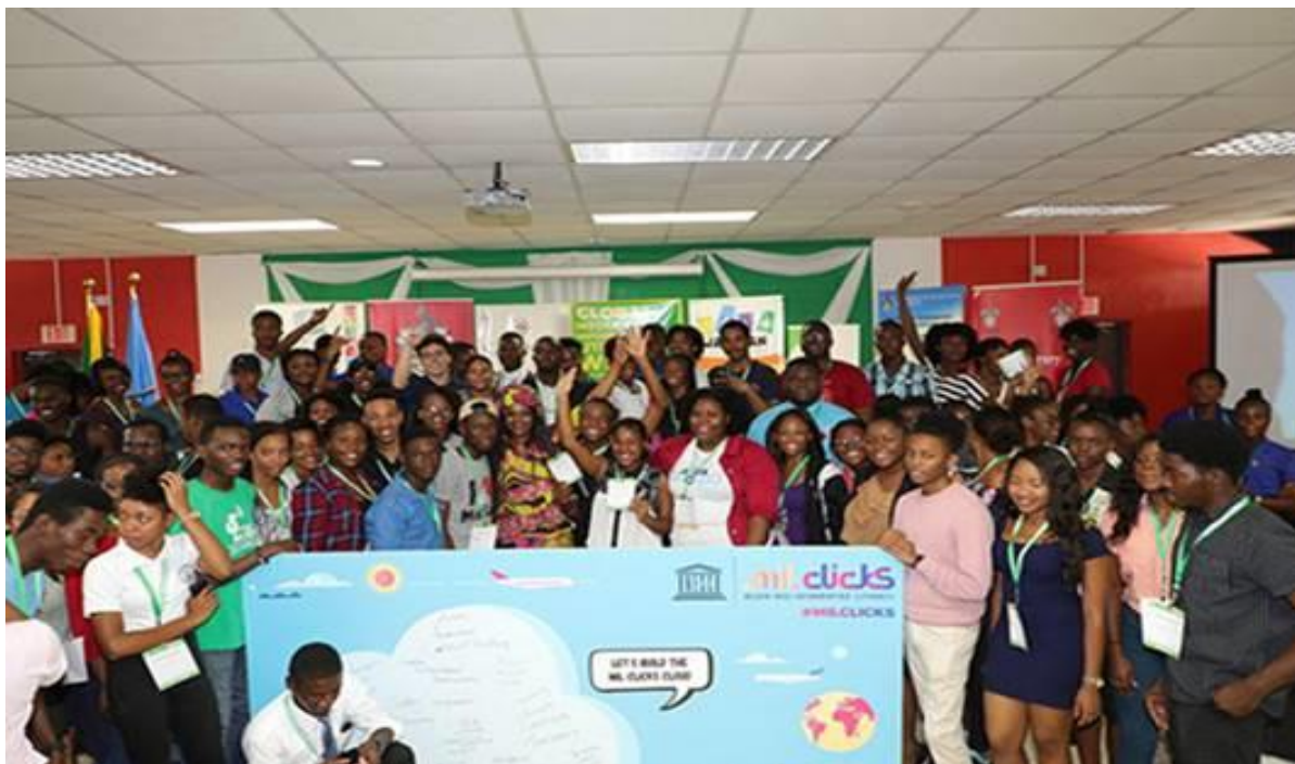
MILID Youth pose for the camera

The MIL Week Youth Agenda is an extension of the UNESCO Global Youth Forum in Paris and included thematic panels and hands-on workshops by various young people and youth organizations and leaders. Youth were engaged not just as target groups for MIL training but also as actors and as part of the solution to achieve media and information literate societies.