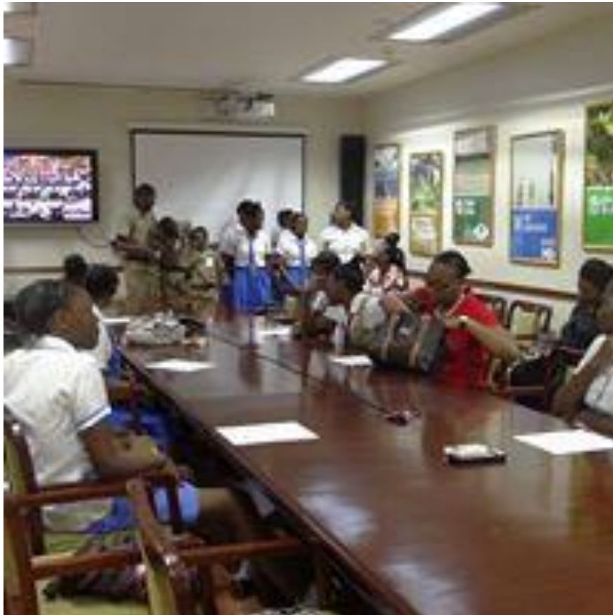
The group during their performance

Jamaica was represented by UNESCO Clubs from Holy Trinity High School and the Young Women's Cristian Association. They were asked to give an oral presentation on a Black achiever from outside the Caribbean. That presentation was on Benedita Da Silva from Brazil as was the dub poem performed by the group of students.