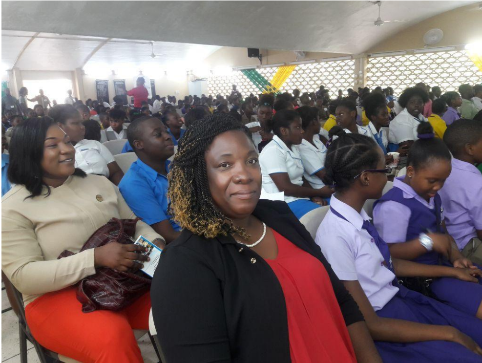
First Consultation at Shortwood Teachers Training College