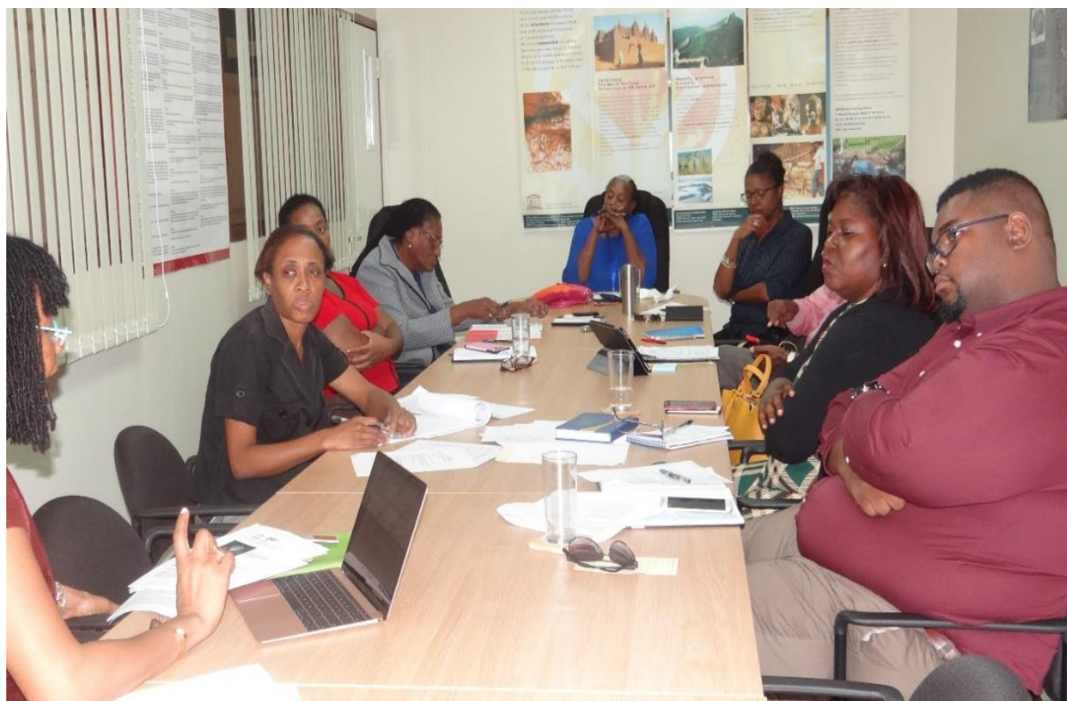
Culture Advisory meeting in session