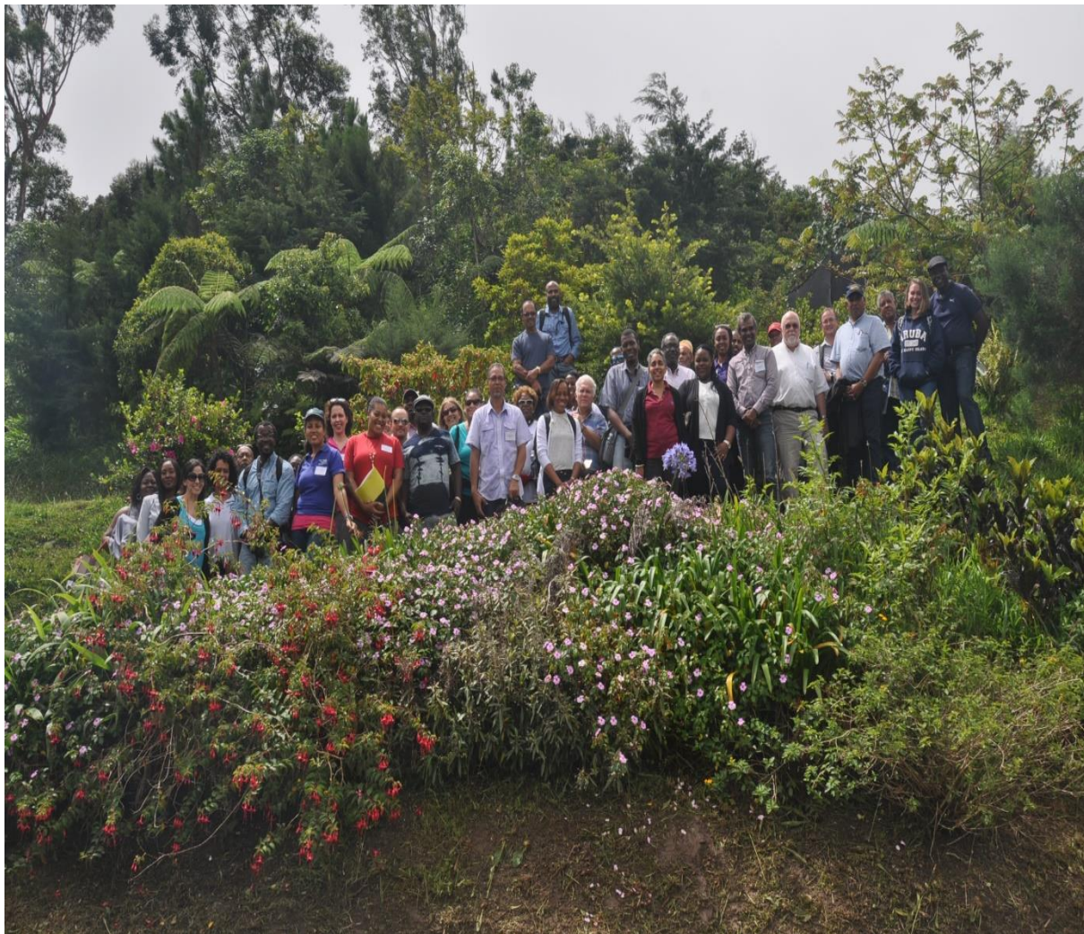
Participants pose for group photo at Holywell, during their visit there

29-31 May 2017: The Regional Symposium Workshop “Rallying for the Protection of Culture and Heritage in SIDS under a sustainable 21st century climate change programme” considers SIDS of the Caribbean region and the impacts of Climate Change and the urgent need to highlight its potential negative effects on heritage in all its forms, with specific emphasis on World Heritage. The meeting utilized the Blue and John Crow Mountains, the Caribbean’s only mixed (cultural and natural values) World Heritage property, as a case study for discussing the potential effects of climate change on both the natural and cultural values of the property. Funding was from the UNESCO Participation Programme, the UNESCO Kingston Cluster Office for the Caribbean, which granted USD 20,000 to facilitate participation