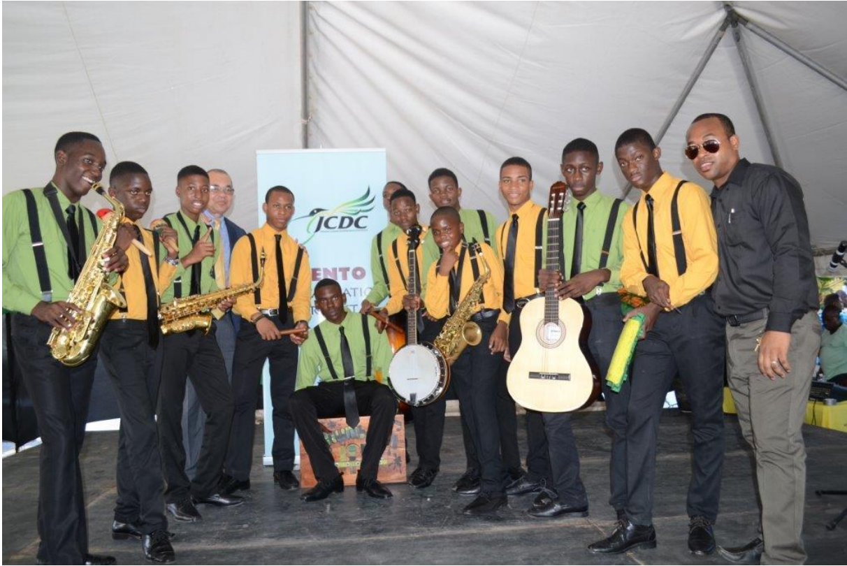
Another of the new mento band