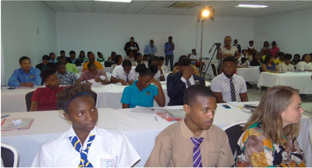
Participants of the Training Workshop