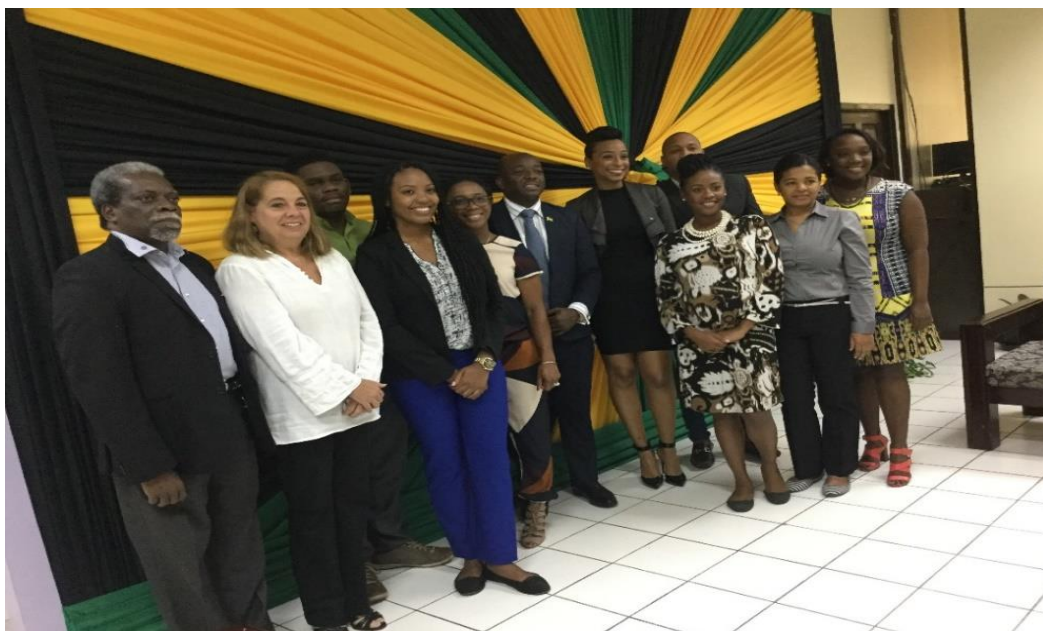
Youth Committee members in group photo