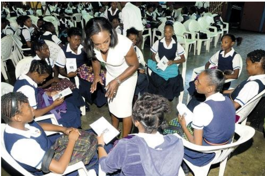
UNESCO Ambassador, Olympian Veronica Campbell Brown, in discussion with students of St Andrew Technical High School (STATHS) during a workshop at the school's Spanish Town Road campus on Thursday.