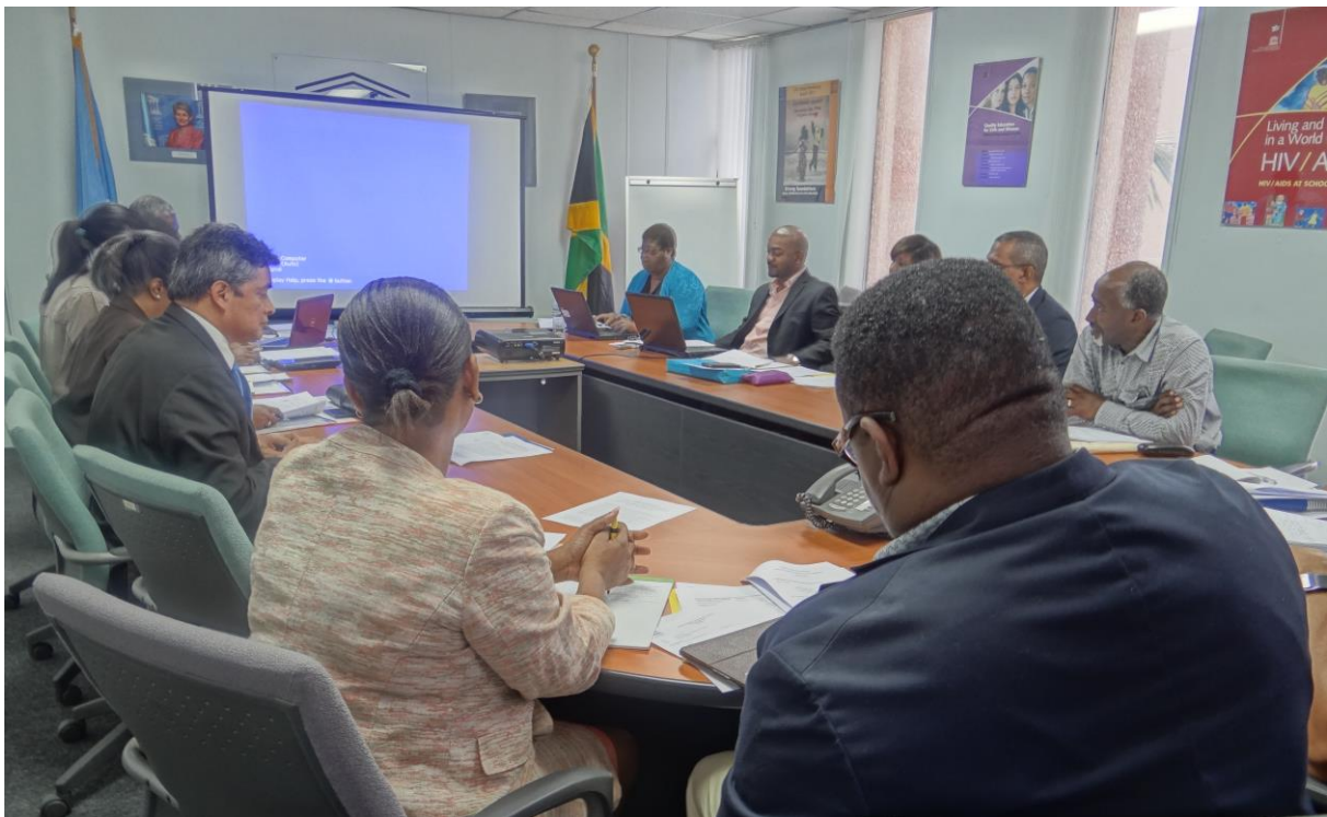
Participants at the Retreat

Since the retreat the Board did not meet but the Executive Committee had three meetings: 9 April 2014, 12 May 2014 and 11 Feb 2015