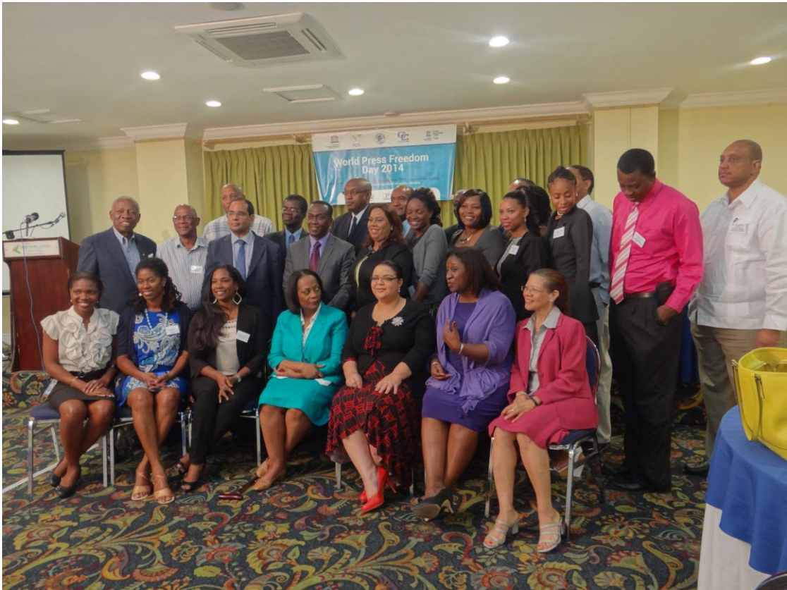
Senator the Hon Sandra Falconer (in red) with participants