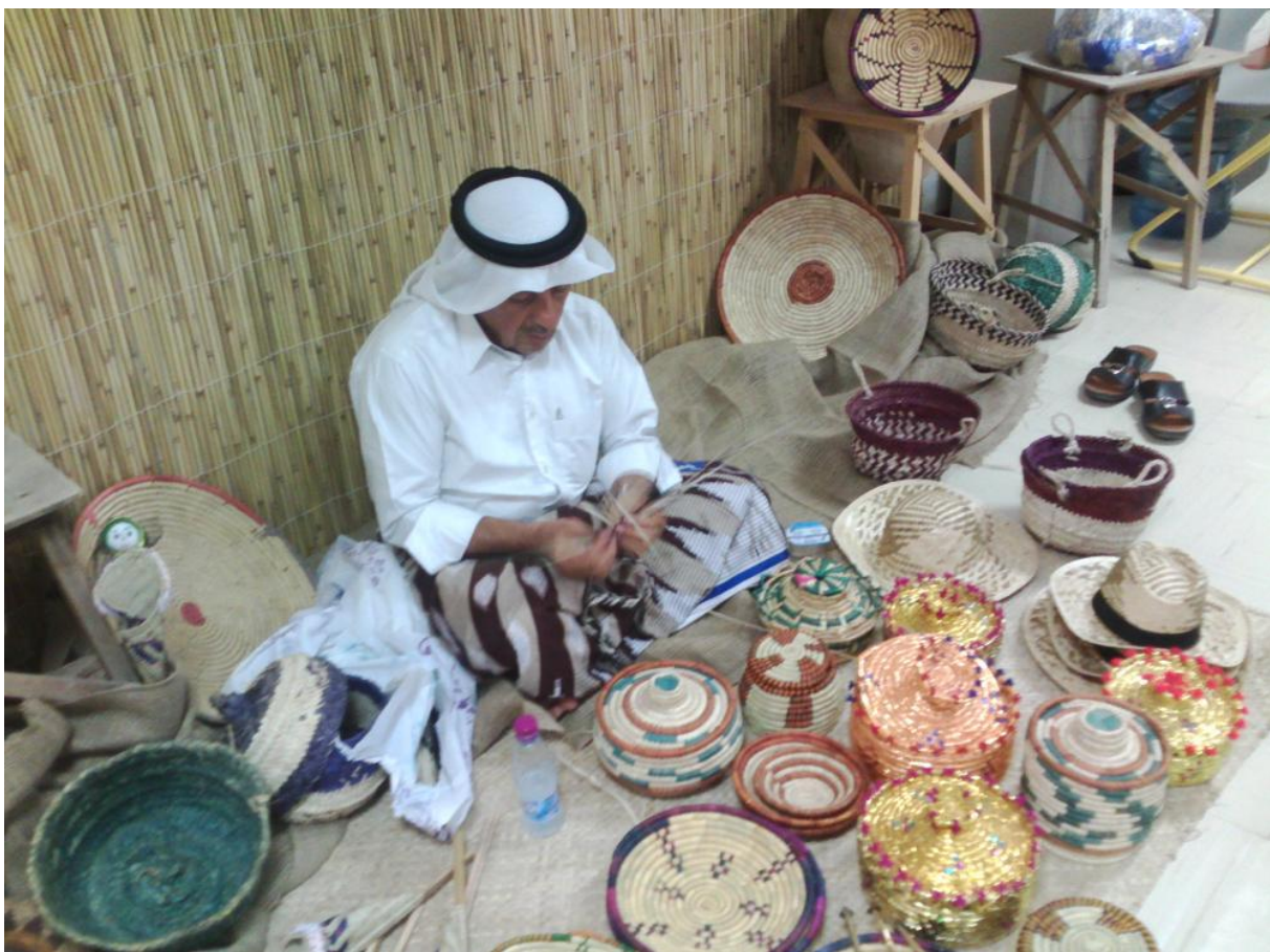
Elderly Qatari showcasing traditional straw craft

The youth forum consisted of lectures, presentations by participants, a conservation workshop, visits to museums and archaeological/heritage sites, an educational activity simulating a World Heritage Committee session (the Youth Model ) – attendant to which were the plenary sessions which required the participation of the youth delegates in preparing a speech to the WHC – and on the final day of the forum, a participatory visit to the Qatar National Convention Centre (QNCC) where the 38th session of the World Heritage Committee (WHC) was being held.