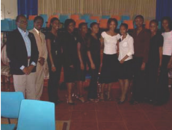
The Director and Secretary General with members of the Executive of the NCU UNESCO Club

The Director of the Caribbean Cluster office launched the first UNESCO Club at the University level on 31 October at the Northern Caribbean. Present were the Secretary-General of the National Commission for UNESCO and Staff and Students of the Northern Caribbean University.