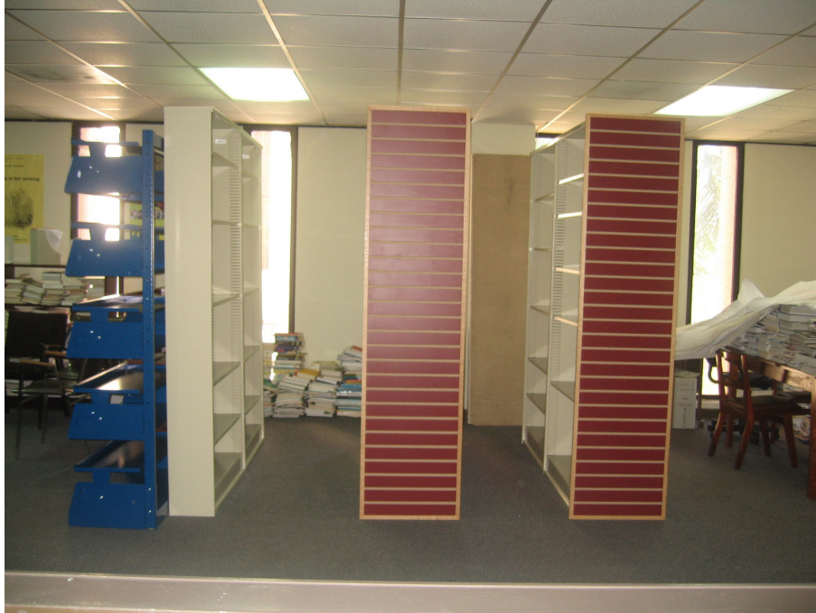
Shelving acquired through Chase Fund

The Centre acquired the services of a professional librarian for its development. For its further enhancement the Commission sought and received funding for shelving through the Chase Fund.