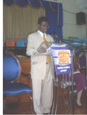
Director of the Cluster office launching the UNESCO Club at NCU