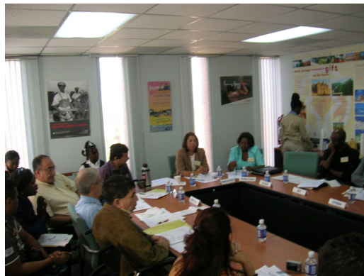
Minister with responsibility for UNESCO and Chairperson of the NATCOM opens the 2 nd Regional Adhoc Meeting of UNESCO Clubs