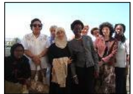
7 UNESCO fellows and members of the organising committee

This fellowship was for the duration of six months (June 16-December 16, 2006) for research in the field of "The role of Women in Society" at the Bibliotheca Alexandrina in Alexandria, Egypt.