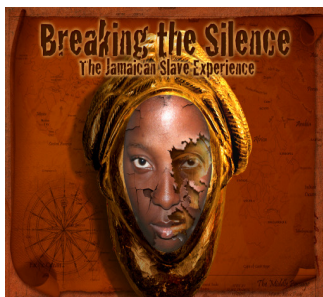
Breaking the Silence

A CDROM of thirty essays on the history of the slave trade with specific reference to the Jamaican experience that is geared to a wide cross section of Jamaican students and the public.