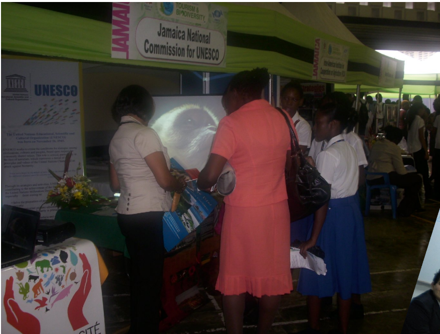
JNC-UNESCO's booth at the World Tourism Day Exhibition, UTECH Auditorium on 30 Sept, 2010